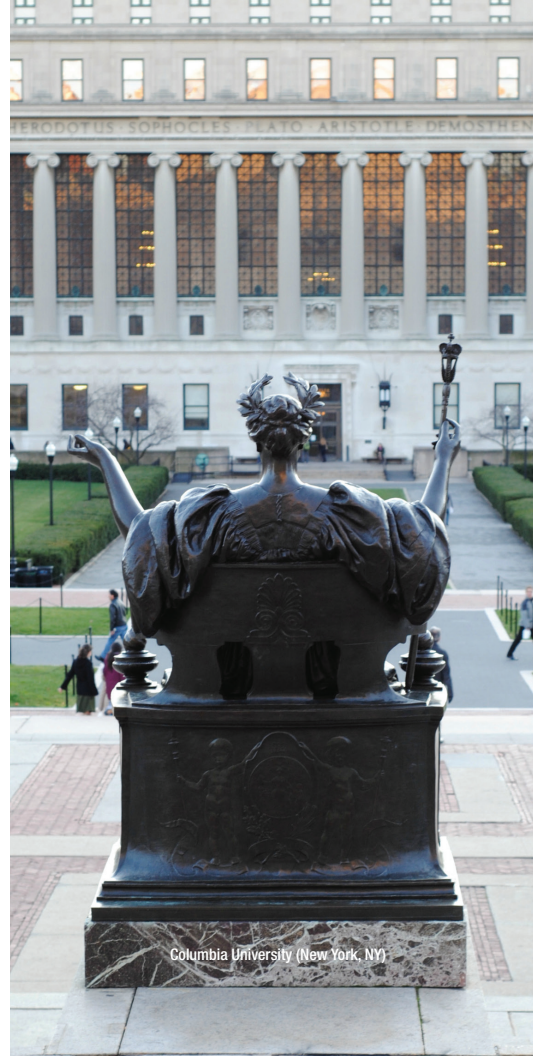
Columbia University (New York, NY)

Former Executive Director of the International Energy Agency